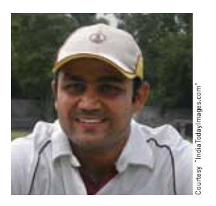
VIRENDER SEHWAG Batting gloves – 125*, v New Zealand, 2009 Fastest ODI hundred by an Indian.

'These batting gloves mean a lot to me. The hundred I hit in Hamilton gave me great enjoyment. I remember hitting Vettori for a six to get the century and break the record. I hope The Foundation gets an equally record-breaking amount of funds from all the memorabilia to be auctioned in Equation 2010. Good luck!'