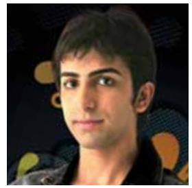
PANKAJ ADVANI Medal - World Billiards Champion, 2007 Cue - International debut, 2000

"Many people ask me what it feels like to be a seven-time world champion at such a young age. Well, it feels great, but there are also many hours of hard work that go with it! The work that The Foundation and other organizations like it accomplish is no less. If they ever need me to help again, they only have to ask."